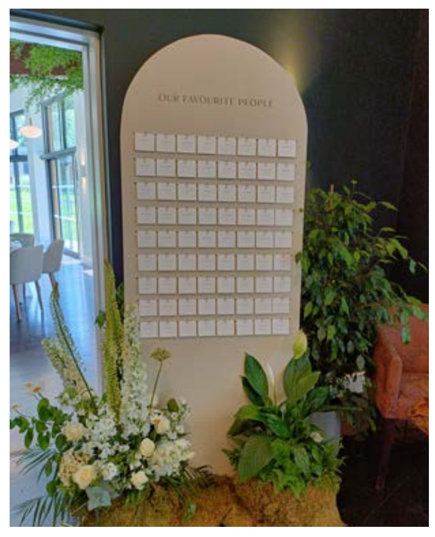
Hothorpe Hall The Woodlands: The Díníng Room in a classic neutral colour palette Props and Styling: Neríssa Eve Weddings Stationary: Jenna Claire Stationary