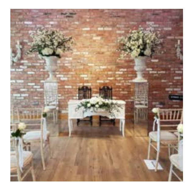
Keythorpe Manor: The Barn & Marquee Styling & Props: Nerissa Eve Weddings