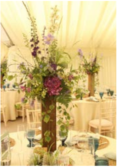
Theme: Summery & country styling with lilacs, creams, blues and greens. Marquee at home on the farm with entrance from the garden.