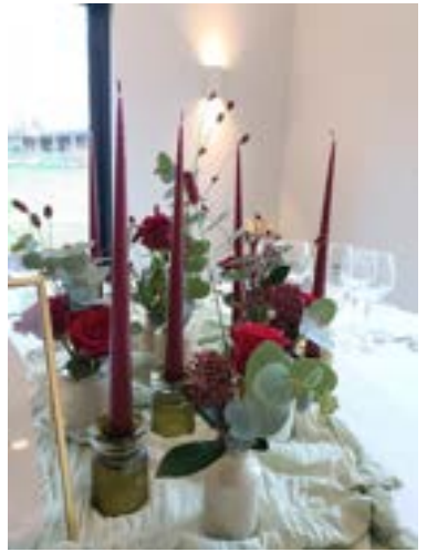
Various Table Design <u>Hothorpe Hall The Woodlands:</u> Various Table Designs Props and Styling: <u>Nerissa Eve Weddings</u>