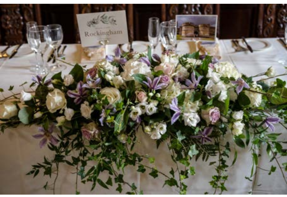
Rockingham Castle: The Great Hall