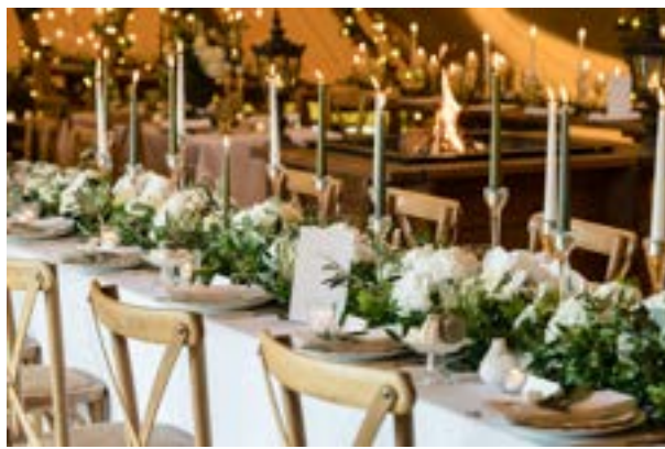
<u>Deene Park:</u> Típí Lakesíde Típí, Stylíng & Props: <u>Teepees & Tents, Neríssa Eve Weddíngs</u> & Statíonary: <u>Jenna Claíre Statíonary</u>