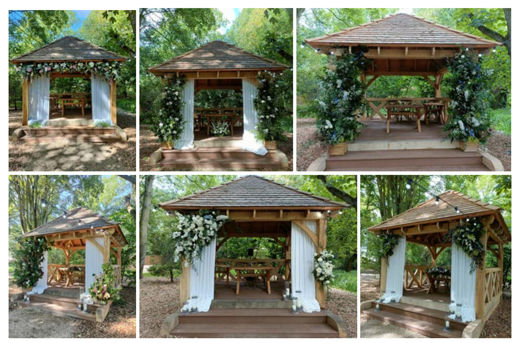
Hothorpe Hall; The Woodlands - A few of the possibilities at The Hideaway Drapes & Props: Nerissa Eve Weddings