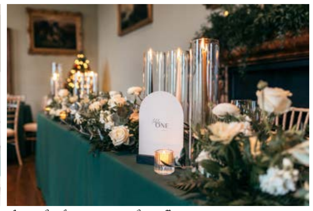
<u>Kelmarsh Hall</u>: Ceremony in The Saloon with a dining set up in The Ballroom Styling & Props: <u>Nerissa Eve Weddings</u>

Stationary: <u>Jenna Claire Stationary</u>