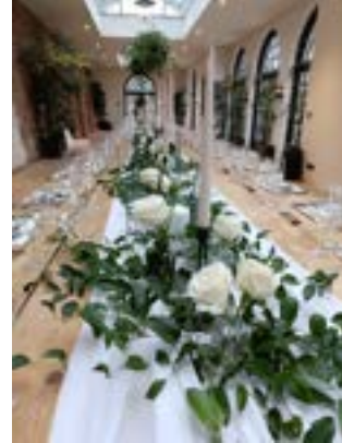
<u>Míddleton Lodge:</u> Ceremony & receptíon in the Fig House Stationary: <u>Jenna Claire Stationary</u> Props: <u>Nerissa Eve Weddings</u>