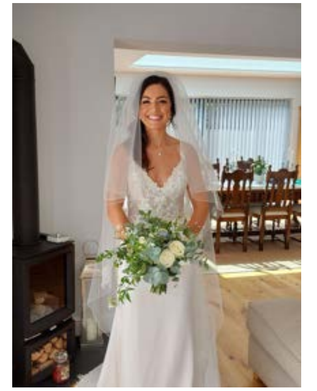
Theme: Summery Pale Blues and Whites with lots of garden greens. Marquee at home