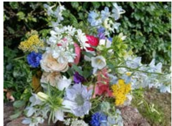
Theme: Bríght and Measdow'y florals <u>Deene Park:</u> Outdoor Ceremony & Típí. Típí: <u>Teepees & Tents</u> & <u>Neríssa Eve Weddíngs</u>