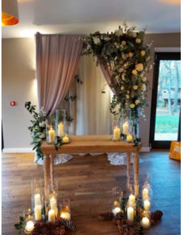
Hothorpe Hall; The Woodlands - Indoor Ceremony Drapes & Props: Nerissa Eve Weddings Stationary: Jenna Claire Stationary