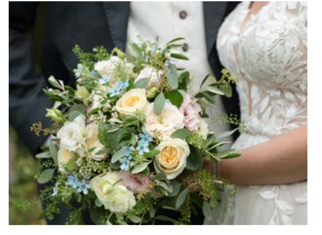
Theme: Summery pastel colour palette with a touch of Italian <u>Deene Park:</u> Ceremony & Marquee in The Walled Garden